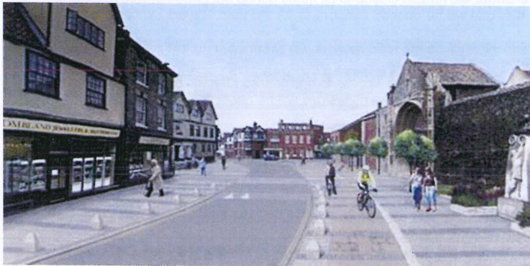
Artists impression of the Tombland pedalway scheme; details shown are subject to amendment

Tombland is set to be transformed by the Pedalways into a place for people