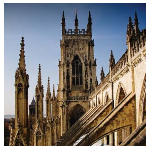
York Minster, UK

Site Visit to Fountains Abbey & Studley Royal World Heritage Site and ICOMOS-UK AGM