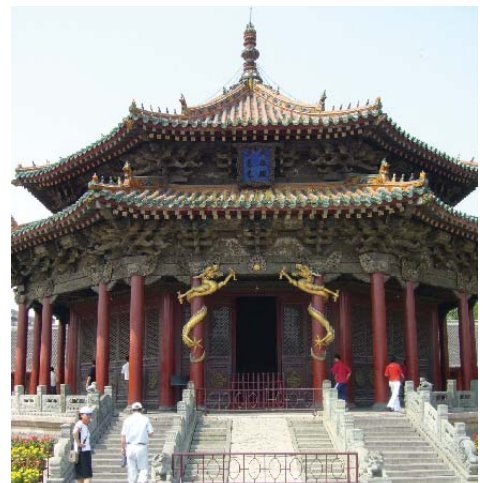
Shenyang Imperial Palace, China

In recent years the China Principles, 2002, and the INTACH Charter for the Conservation of Unprotected Architectural Heritage and Sites in India, 2004, have developed conservation guidance related to specific cultural traditions. Do these still somehow reflect the idea of an over-arching conservation philosophy that can be seen to be global? Or are they stand alone documents whose similarities merely reflect the interchange of ideas between east and west?