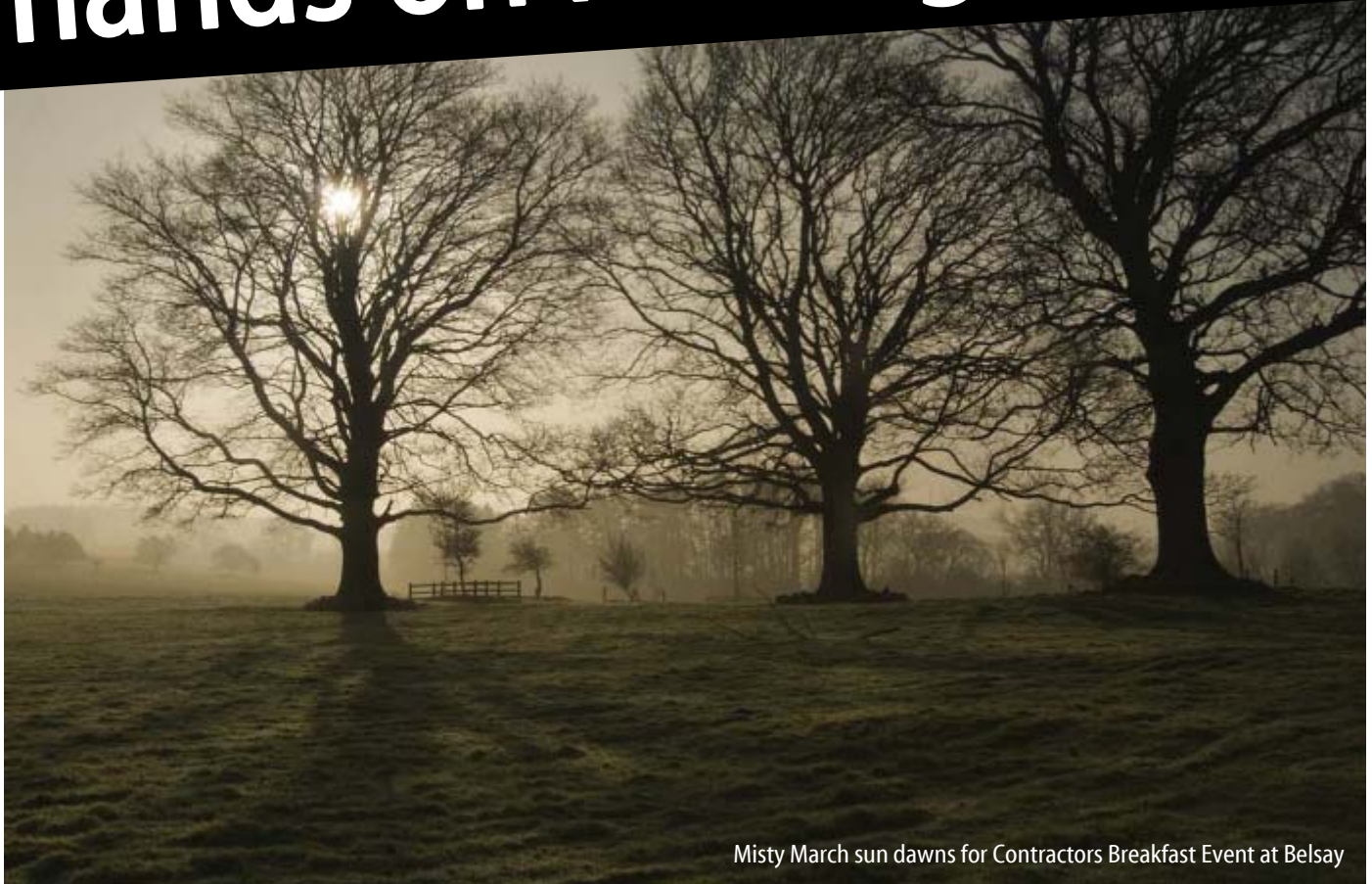
Misty March sun dawns for Contractors Breakfast Event at Belsay