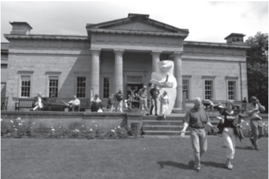
IHBC Annual School 2005 delegates in the Museum Gardens, York